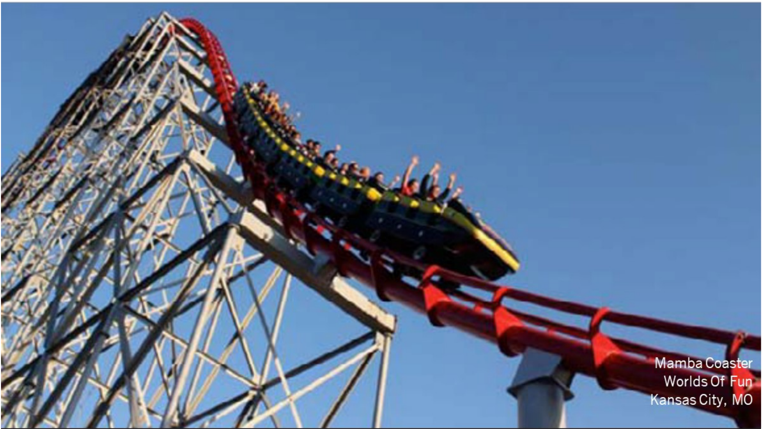
Mamba Coaster Worlds Of Fun Kansas City, MO