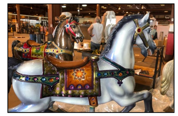
Chance has continued turning out new and refurbished carousels, building a 20-foot custom unit for Pacific Amusement International Co. of Seoul, South Korea, and 28-foot unit for the Municipality of Cayey in Puerto Rico.