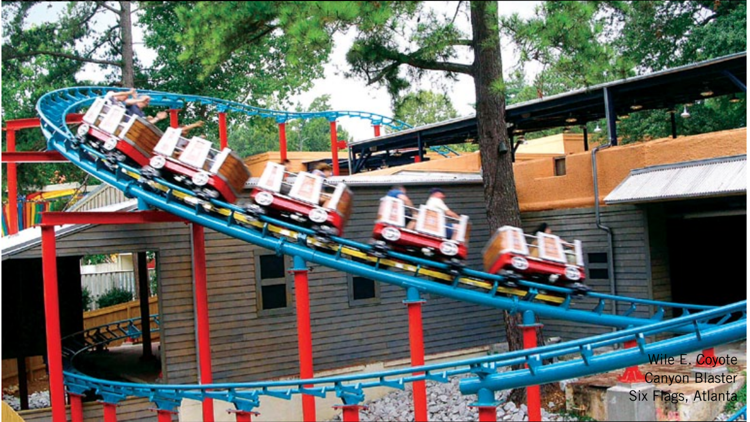
Wile E. Coyote Canyon Blaster Six Flags, Atlanta